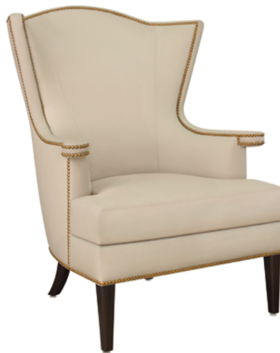
Model: MER01 33.5W 35D 45H 23.5SW 19.5SD 19SH 25AH

A throwback to the neoclassical era, the Meria Lounge chair is tailored luxury. The cushion is removable for ease of cleaning. The formal stately back, the classic legs and the standard nail head trim all make the Meria stand out as an icon to style.